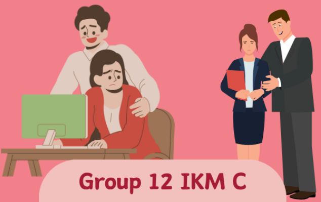
Group 12 IKM C

Sexual harassment can happen to anyone, including men and women. Here are the forms of sexual harassment that you need to be aware of.